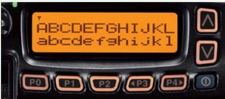
Two line setting display example.

With a high contrast dot matrix display, upper and lower case characters can be easily distinguished. You can change the display setting to show one line and 12 characters, or two lines and 24 characters via programming. LCD backlighting is standard.