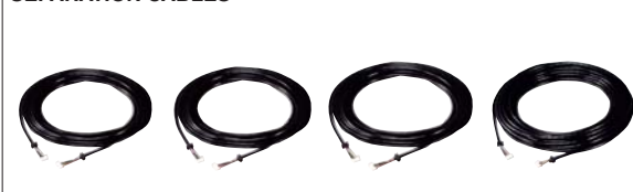
OPC-609 1.9m; 6.2ft OPC-607 3m; 9.8ft OPC-726 5m; 16.4ft OPC-608 8m; 26.2ft