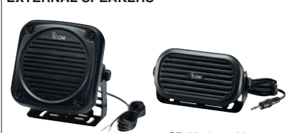
SP-30 20W rated input SP-35: 2m cable SP-35L: 6m cable