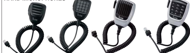
HM-152 HM-152T DTMF microphone HM-148G Heavy duty microphone HM-148T Heavy duty microphone with DTMF keypad