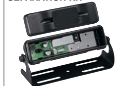
RMK-3 Use with one of the following separation cables.